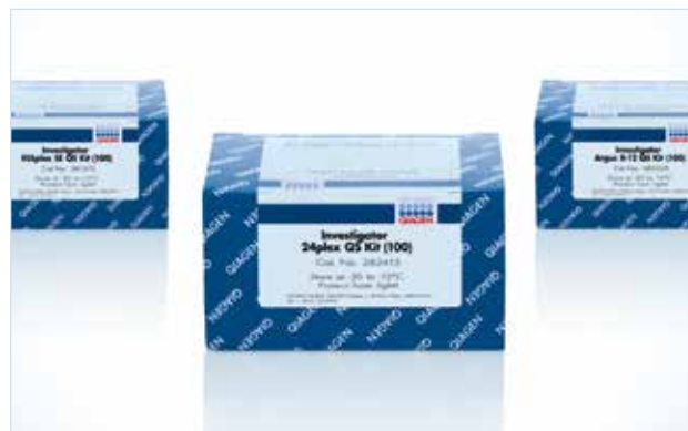
Figure 1. Investigator STR Assays containing the unique Quality Sensor.